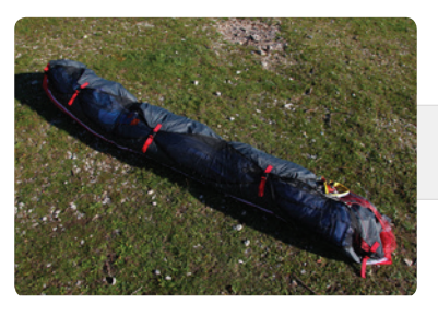
Step 9. Turn the Saucisse on its side and make the first fold just after the LE reinforcements. Do not fold the plastic reinforcements, use 3 or 4 folds around the LE.