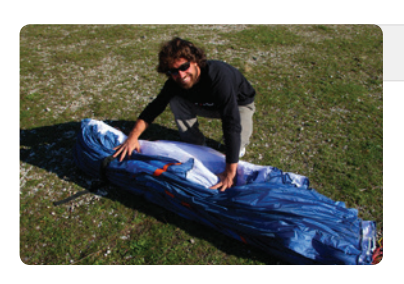
Step 5. Once the LE and rear of the wing have been sorted, turn the whole wing on its side.