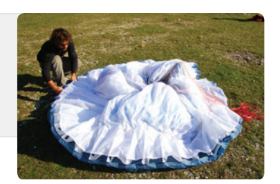
Step 2. Group LE reinforcements with the A tabs aligned, make sure the plastic reinforcements lay side by side.

Step 1. Lay mushroomed wing on the ground. It is best to start from the mushroomed position as this reduces the dragging of the leading edge across the ground.